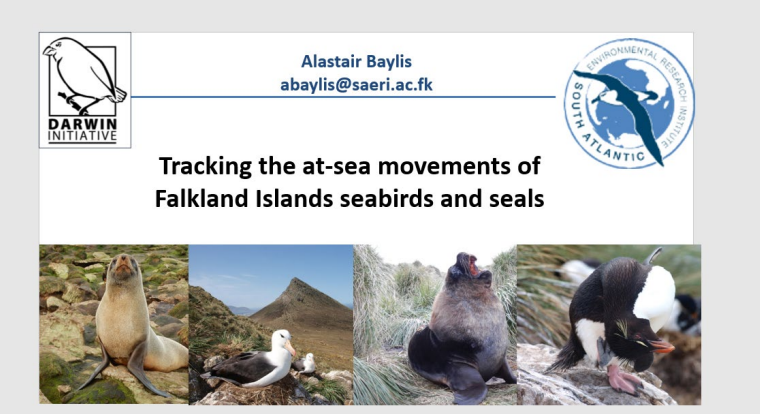
Fig 3: A public talk was held at the end of August to disseminate findings from our first field season. A workshop is planned for March 2023. The first slide of the presentation, which pictures the Darwin logo, is also pictured.